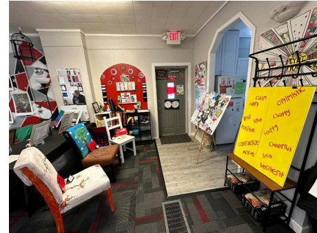
Youth Art Voice