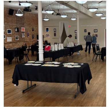
Youth Art Voice